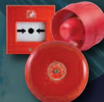
Conventional signalling devices