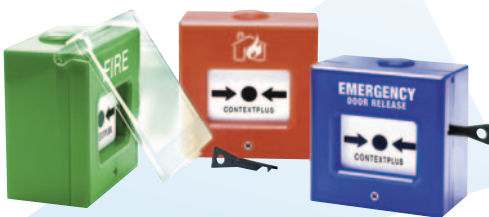
Resettable Fire Call Point Part Numbers below

Has a simple 'RESET' mechanism comprising tough ABS plastic operating elements that simulate break glass activation. Is instantly reusable without environmental hazard caused by fragments of broken glass-making. Perfect for food processing plants and places that are prone to false activations such as schools, shopping malls and other high traffic areas. When wired for open circuit operation, the circuit closes instantly when activated. Also meets the requirements of BS5839 Part 2 and EN54 Part 11.