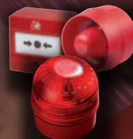
Addressable Signalling devices