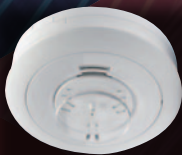
Conventional wireless fire alarm systems