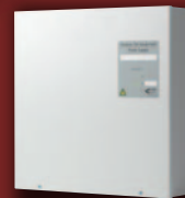
EN54 compliant power supplies