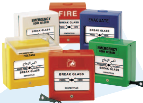
Fire Alarm Call Point Part Numbers below