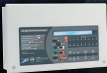
Addressable fire detection panels