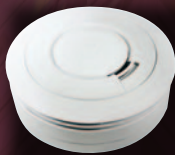
Stand-alone mains & battery operated smoke, heat & CO alarms