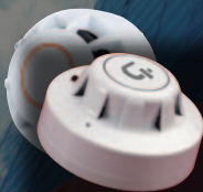
Addressable smoke and heat detectors