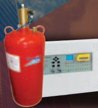
HFC227ea Conventional fire suppression systems