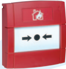
Conventional Manual Call Point Part Number MCP1A-525IMC