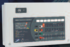
Conventional fire detection panels