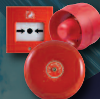
Conventional signalling devices