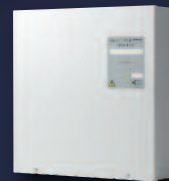
EN54 compliant power supplies