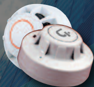
Conventional smoke and heat detectors