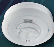
Conventional wireless fire alarm systems