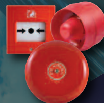
Conventional signalling devices