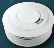
Stand-alone mains & battery operated smoke, heat & CO alarms