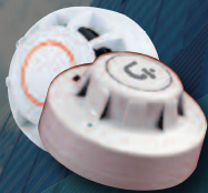
Conventional smoke and heat detectors