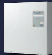
EN54 compliant power supplies