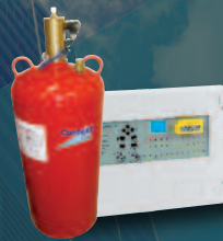
HFC227ea Conventional fire suppression systems