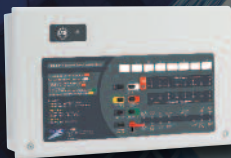
Conventional fire detection panels